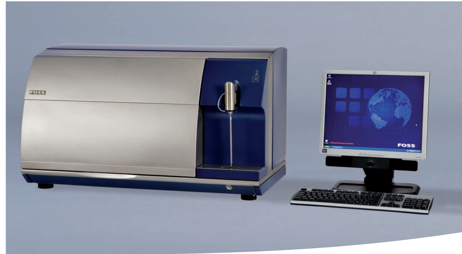
MilkoScan™ FT2 for advanced compositional analysis of milk and dairy products