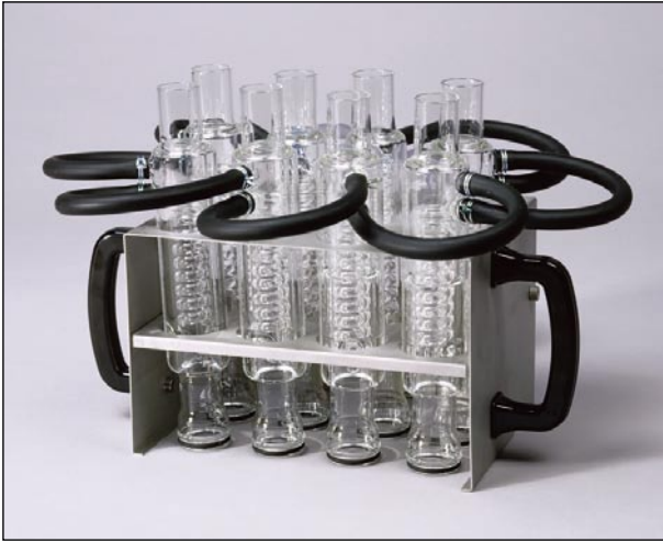
There are Reflux Heads for 250 ml Digestion Units.