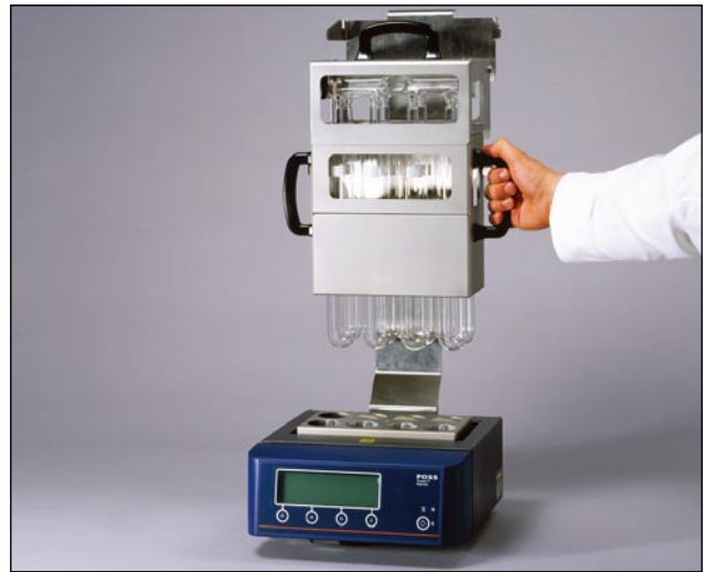
The Rack System saves space.