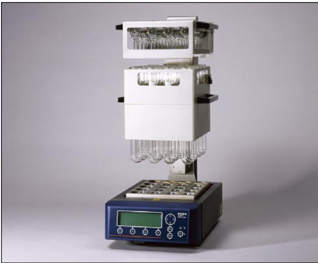
The Lift eliminates heavy handling.