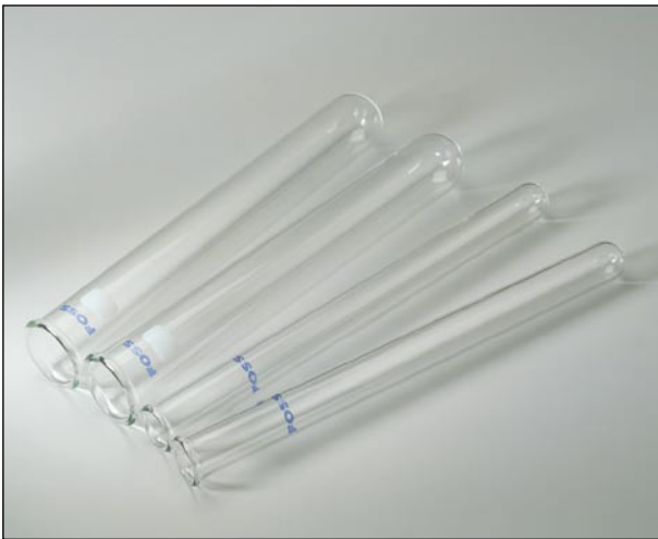
Select the correct tube for your application.