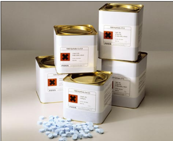
Kjeltabs, salt and catalyst in tablet form.

vented via a tubing outlet. In the interest of GLP and H&S this venting tube should be directed into a fume cupboard. When the Scrubber Unit is connected to an Auto Lift or Auto Rack system the program will fully control the function including switching from high to low aspiration settings.