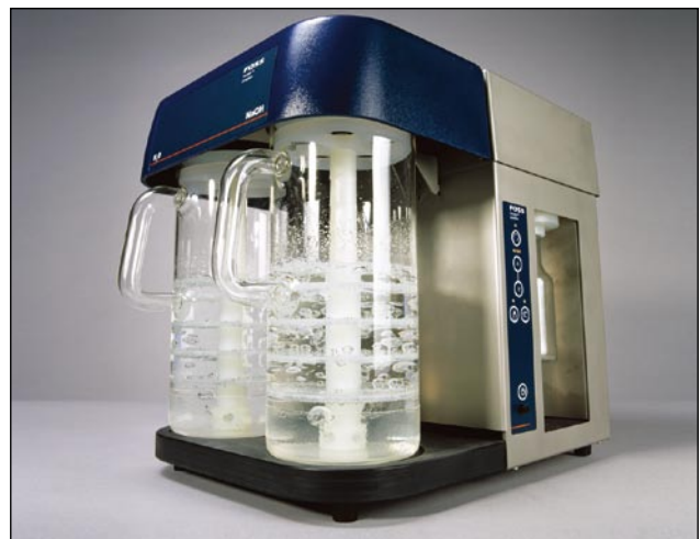
The Scrubber neutralizes the corrosive fumes.