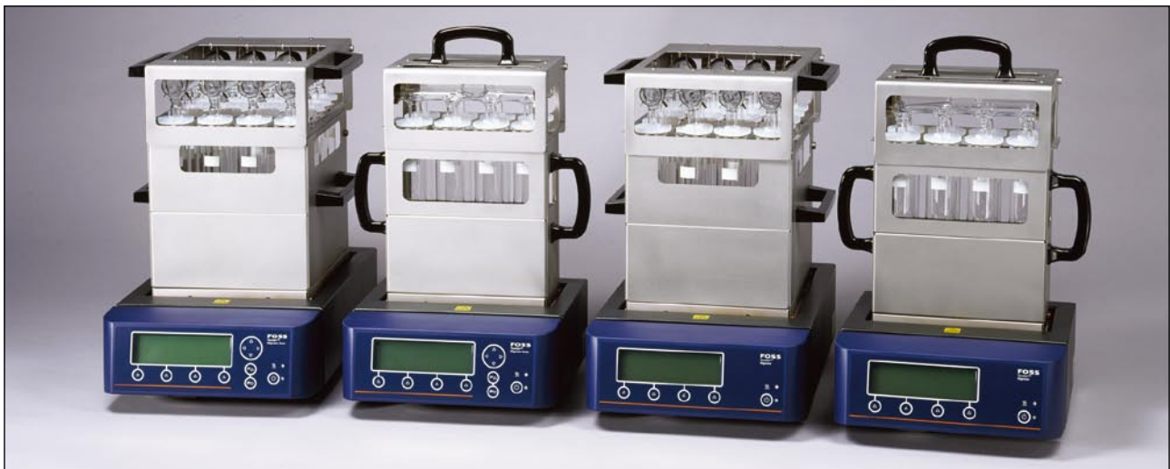
All Digestion Systems are based on one of the "four" Digestion Units for either 250 ml or 100 ml tubes*. * Tube volume to be specified when ordering your digestion unit.